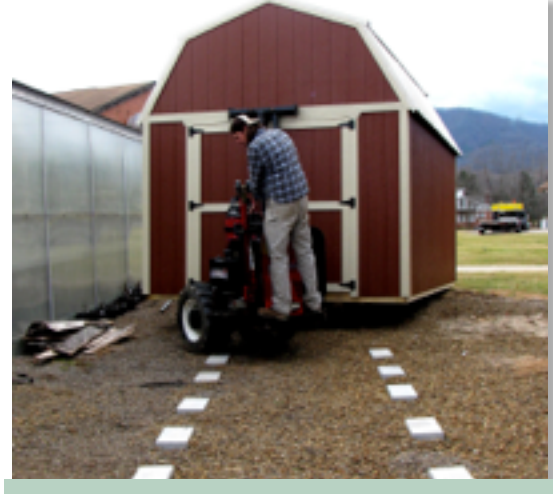
The storage unit is pulled into its final resting place next to the greenhouse.