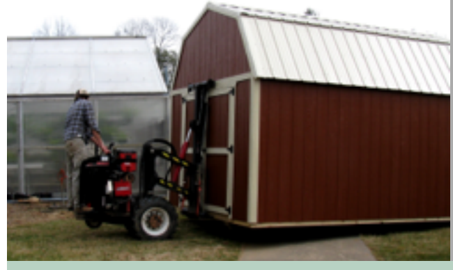
Because there are "rollers" beneath the storage unit, it is easy to pull it across the grass.