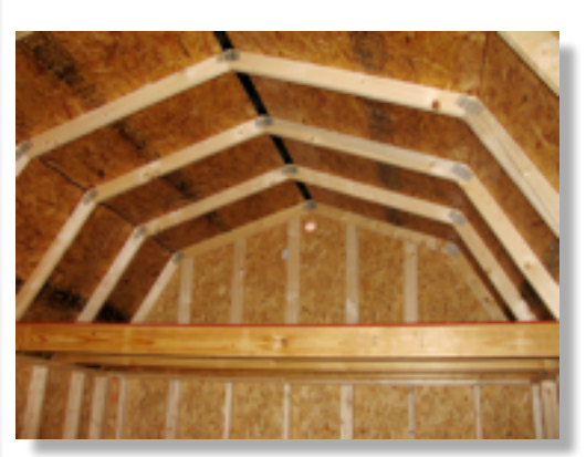
The upper lofts inside the storage unit provide ample space for additional storage.