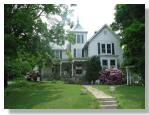
The Blaylock House as it appears today.